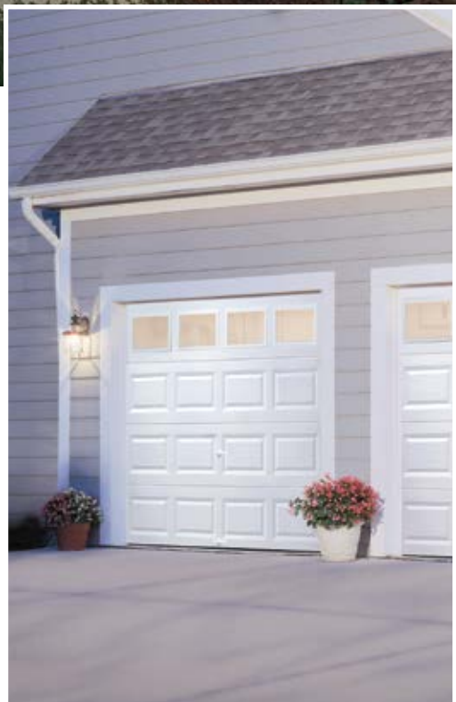
Model T42S, Short Traditional Panel with Plain Short Windows