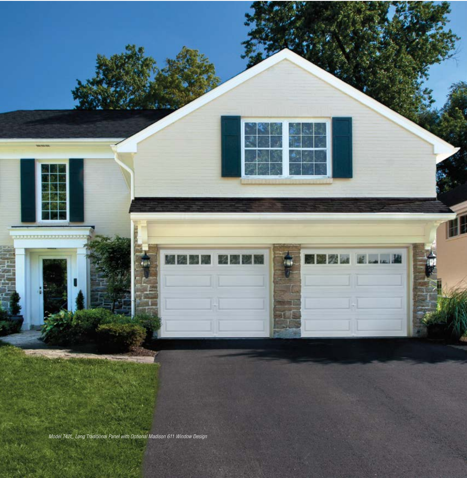
Model T42L, Long Traditional Panel with Optional Madison 611 Window Design