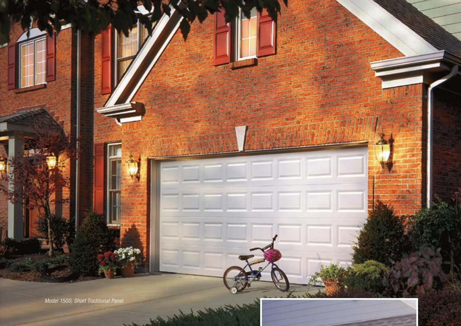
Model 1500, Short Traditional Panel