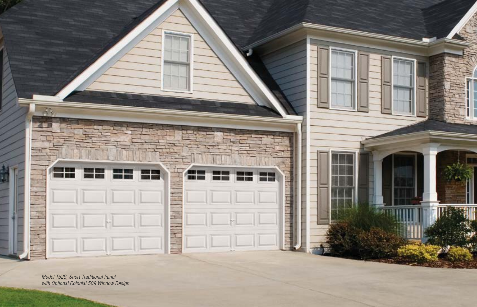
Model T52S, Short Traditional Panel with Optional Colonial 509 Window Design