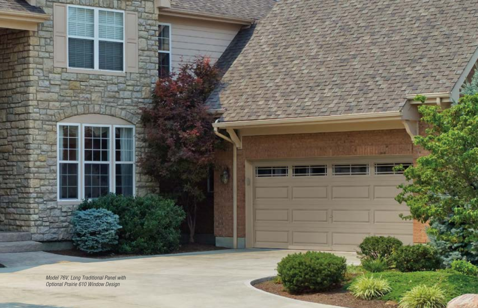
Model 76V, Long Traditional Panel with Optional Prairie 610 Window Design